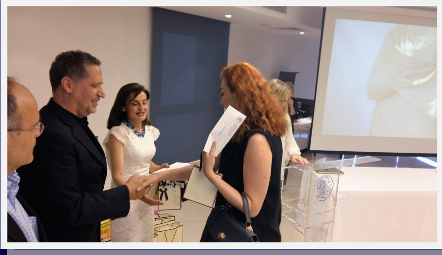
Congratulating the first prize laureates...