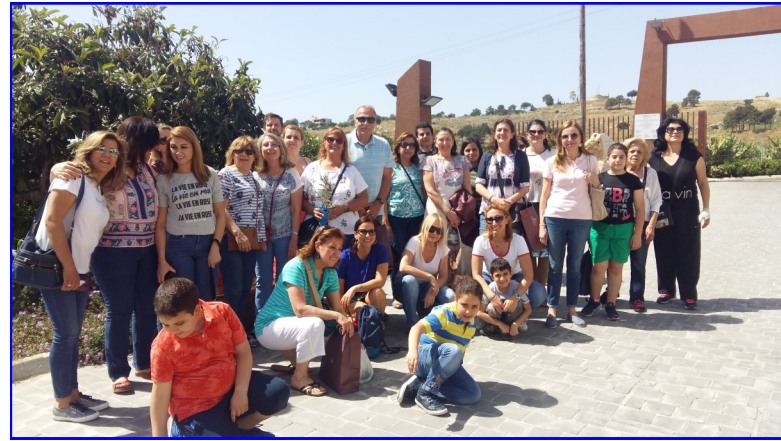
At the workshop organized on May 18 at the Ateliers de Tyr.

Readers can also find latest news regarding Greece or Greeks from abroad in our section "Greek News" together with a new column dedicated to the Cyprus Community in Lebanon Association and of course, news from Lebanon titled Real Time News.