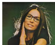
Nana Mouskouri not only a famous singer but a UNICEF spokesperson & a Greek deputy in the European Parliament