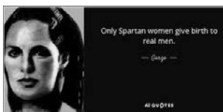
Gorgo the Queen of Sparta

Greek women also impacted the course of history. To name a few :