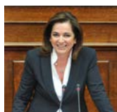
Dora Bakoyannis 1 st female mayor of Athens