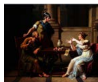
Aspasia the Intellectual & Political Advisor